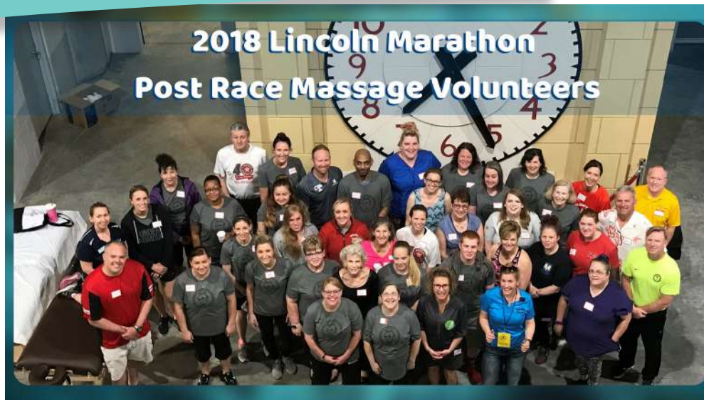
Post Event Sports Massage Volunteers at the 2018 Lincoln Marathon.